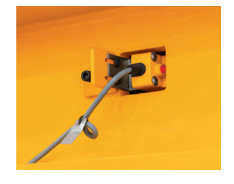
Blade Breakage Detector If any blade breakage occurs during cutting, the machine will automatically stop to ensure safety of operator and machine.